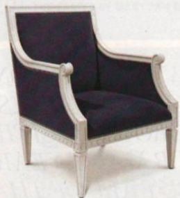
Jonathan Adler LOUIS XVI CHAIR