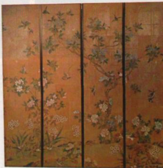
Gracie ANTIQUE WALLPAPER SCREEN

“To create a modern twist on an old-fashioned favorite, Jonathan Adler has taken a traditional Louis XVI chair and high-glossed it white and added a simple navy fabric. I would recommend this to someone who wants to add a little pizzazz to his or her decorating palette, without compromising on style.” Jonathan Adler ($1,295), 1011 W. Fifth St., Ste. 130, 512-296-2507; jonathanadler.com