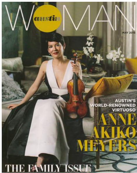
Austin Woman May 2015 Stylish Rooms For Kids (1 of 2)