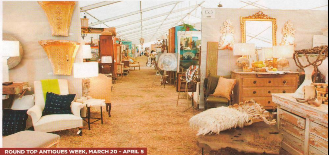
ROUND TOP ANTIQUES WEEK, MARCH 20 - APRIL 5

It's that time of year again: one of the biggest shopping events in the country, Antiques Week in Round Top, Texas. So grab some girlfriends, plenty of cash, borrow a truck if you have to and head east. Round Top and the surrounding towns are just a little more than an hour's drive away. Whether you're going to make it a day trip or turn it into an annual girls' getaway, you need to know how to get around to make the most of your time.