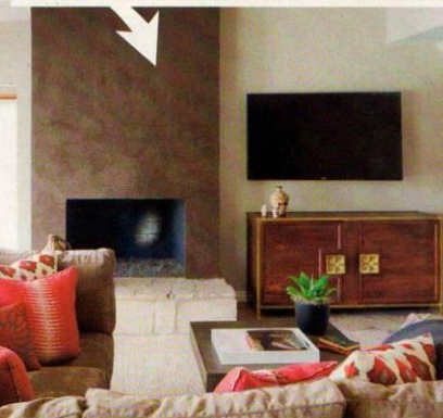
LIVING ROOM: The clients wanted their home to be comfortable and functional, but at the same time, they wanted it to be a combination of contemporary and traditional. We used the clean, modern lines of the home, and softened them with the L-shape custom sofa and pillows and a more traditional-style cabinet. A large sisal rug covering the majority of the stone floor adds warmth and pulls it all together.