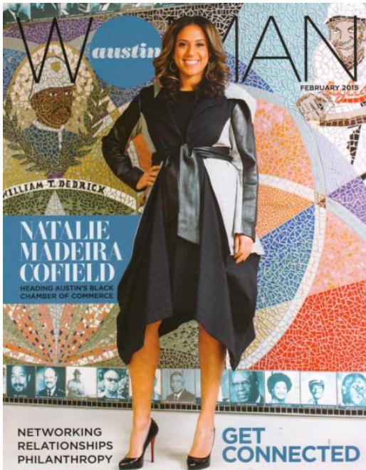
Austin Woman Magazine February 2015 When DIY Goes Awry (1 of 2)