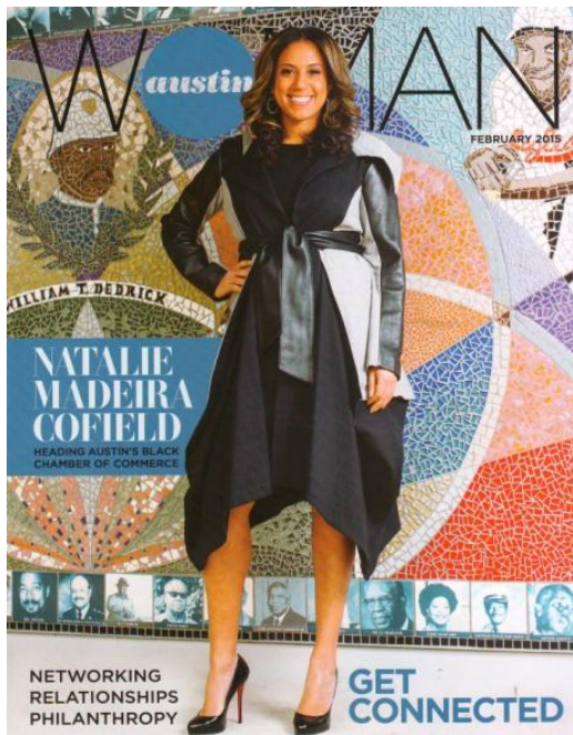
Austin Woman Magazine February 2015 When DIY Goes Awry (1 of 2)